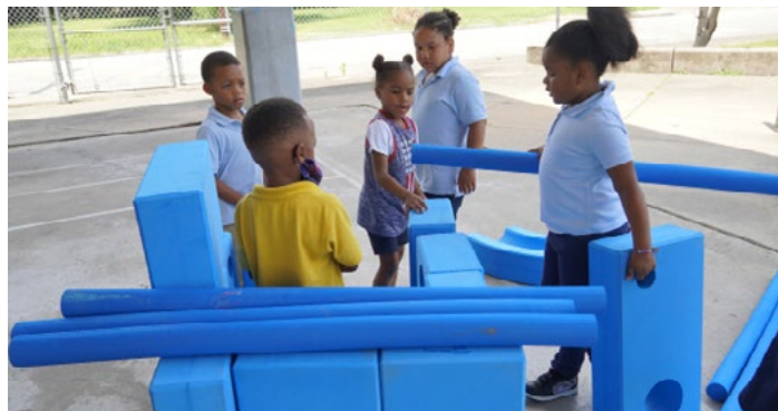
You helped spark our students' imaginations!